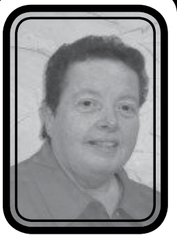
By Gwen Cassel New York