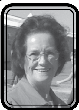
By Jacquelyn Sistrunk Alabama

Questions abound. Would the Panama Canal or the railway be cheaper or faster?