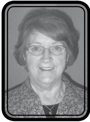
By Phyllis Howatt North Dakota

Lentil is a pulse (grain legume) crop. In North America, much of the acreage is in eastern Washington, northern Idaho, and western Canada, where drier growing season conditions prevail. It has been grown in that area since the 1930s as a rotation crop with wheat. Most of the lentil production in the United States is exported, but domestic consumption is increasing.