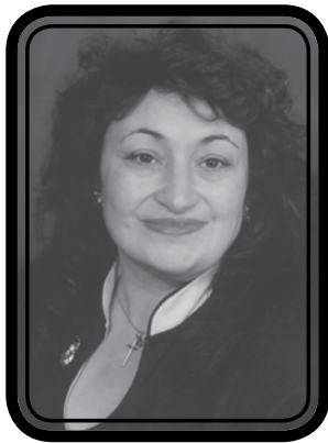
By Klodette Stroh Wyoming