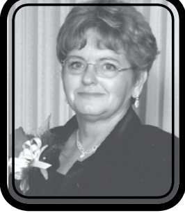
By Pam Potthoff Nebraska