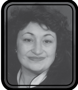
By Klodette Stroh Wyoming